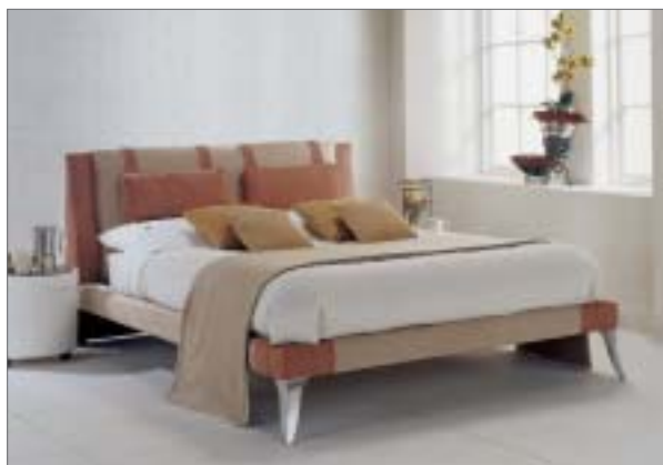
Airsprung Beds – Sabina