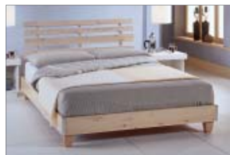
Airsprung Beds – Dansk