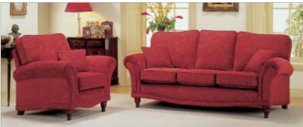
Cavendish – Bloomsbury sofa and chair