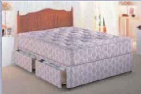
Airsprung Beds Contracts – Shakespeare