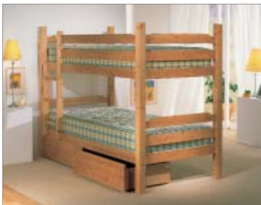
Airsprung Beds – Keilder bunk bed