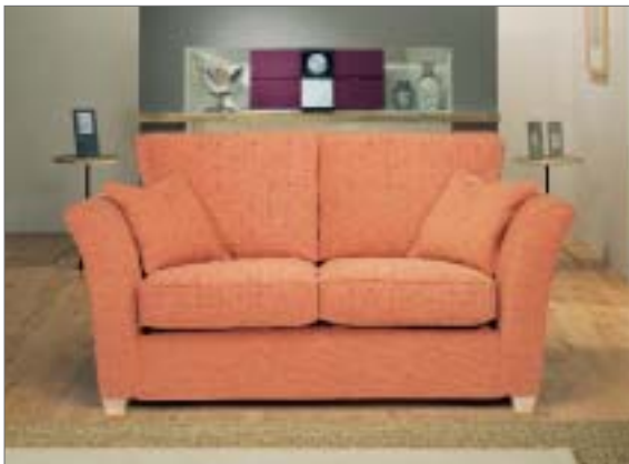
Gainsborough – Manilla sofa bed