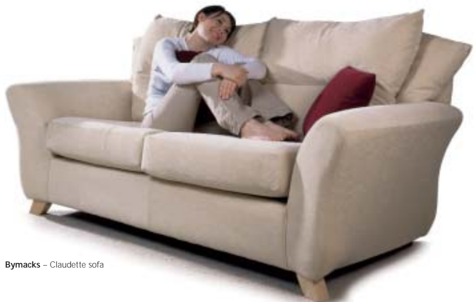
Bymacks – Claudette sofa

The Group operates a number of pension schemes. Contributions to these schemes are charged to the profit and loss account by spreading the cost of the benefits over the expected remaining working lives of the members.