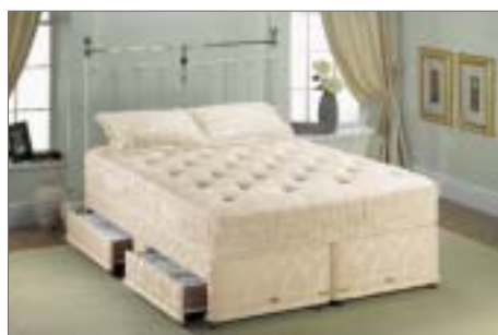
Sprung Slumber – Diamond Shield