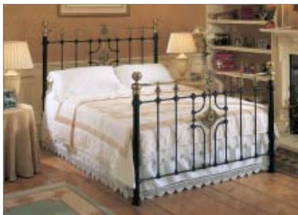
Enchanted House – Cambridge