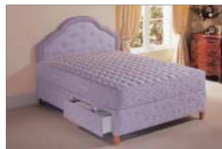
Airsprung Beds – Tranquil