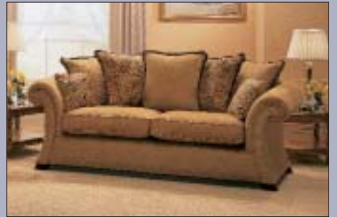
Cavendish Upholstery – Kimberley sofa