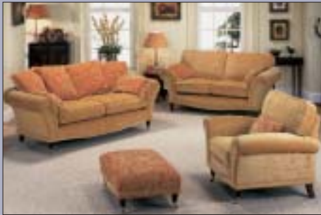
Cavendish Upholstery – Cadogan suite