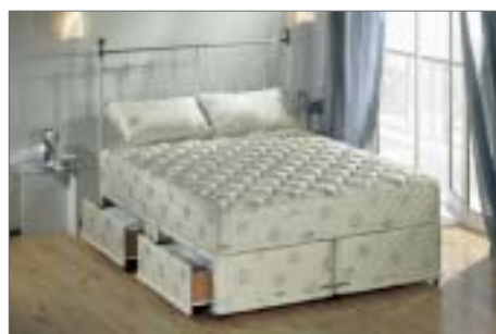
Sprung Slumber – Silver Shield