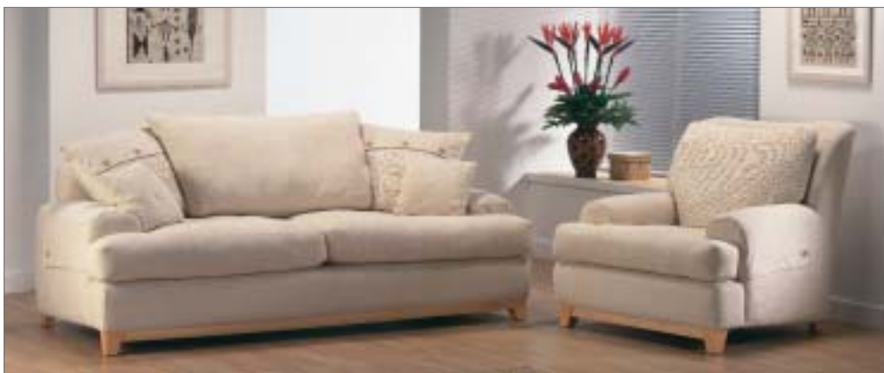
Cavendish – Alexa sofa and chair