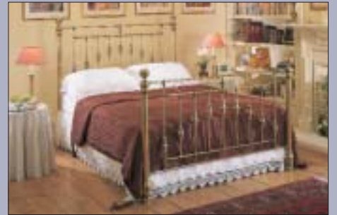
Enchanted House – Boston