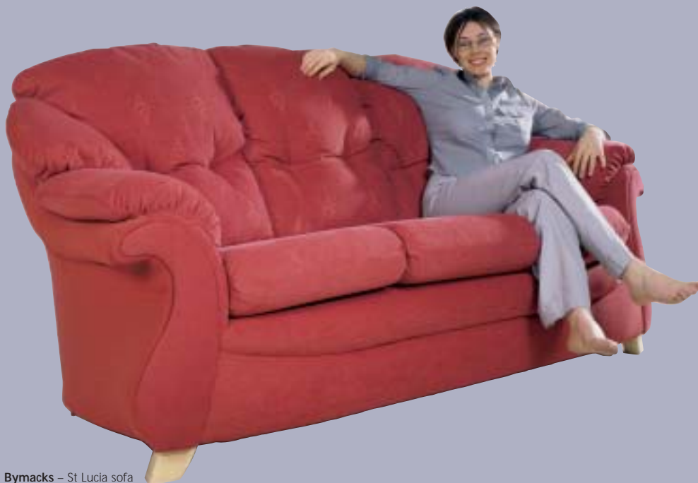
Bymacks – St Lucia sofa