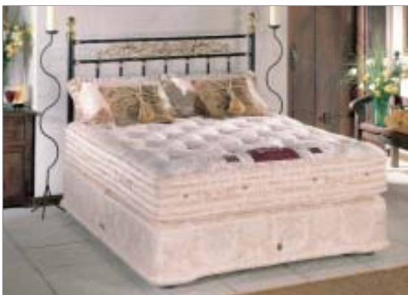
Gainsborough – Virtuoso