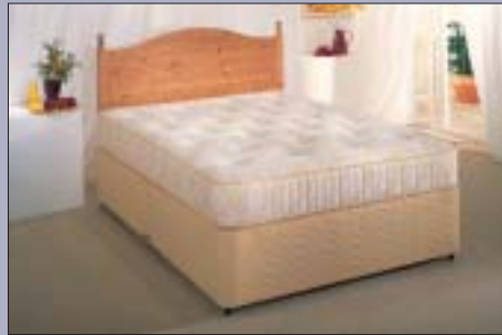
Airsprung Beds – Tempest