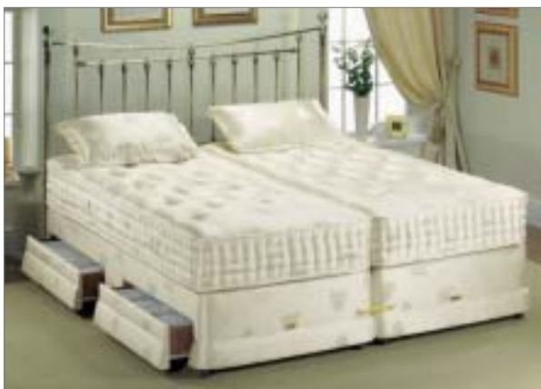
Sprung Slumber – Sovereign Shield