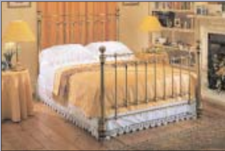
Enchanted House – Westminster