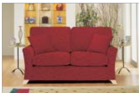
Gainsborough – Milton sofa bed