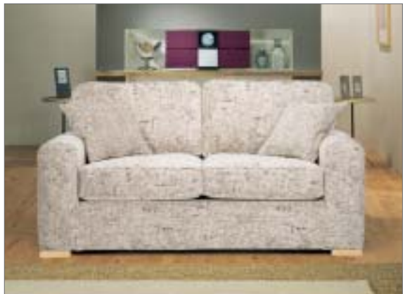
Gainsborough – Tang sofa bed