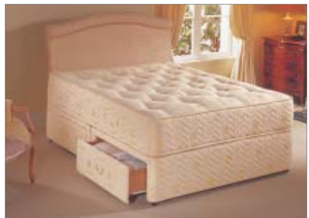
Airsprung Beds – Royal Emperor