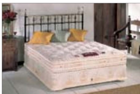
Gainsborough – Concerto Supreme

The Group's subsidiaries are located throughout the United Kingdom in Wiltshire, Cornwall, Devon, Gloucestershire, Lancashire and Glasgow.